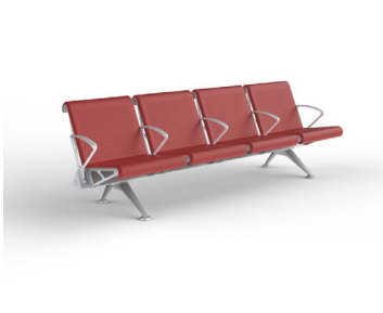
Low back moulded polyurethane