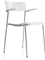
Campus Air Armchair