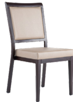
W 1.2 HB