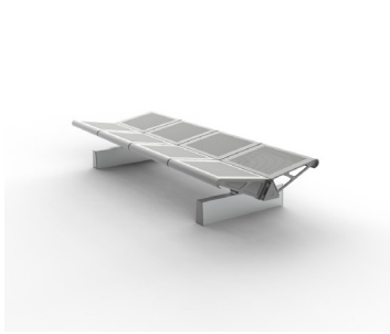
Backless Bench Perforated Steel