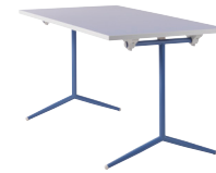
Quickly Table T-Leg