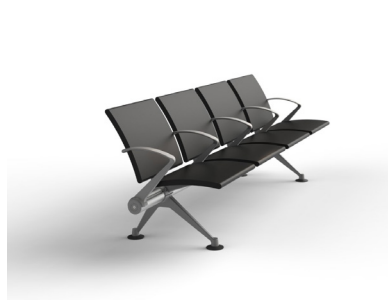
Flite Seating System