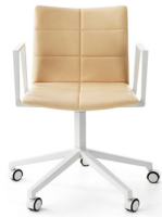
Archal 5 feet swivel