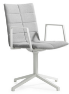
Archal Armchair swivel