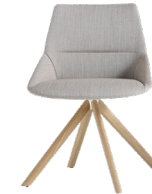
Dunas XS Range