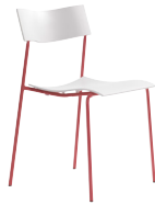
Campus Air 4 Legs