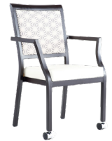
W 2.2 HBC