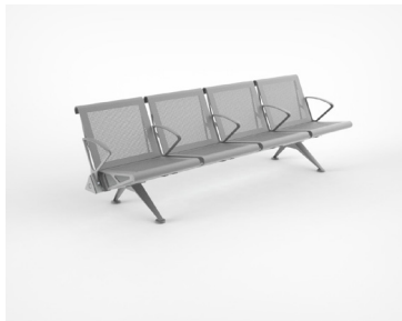
Low back perforated steel