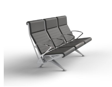
High back moulded polyurethane