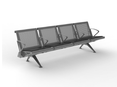
Low back perforated steel