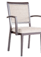
W 2.2 HB