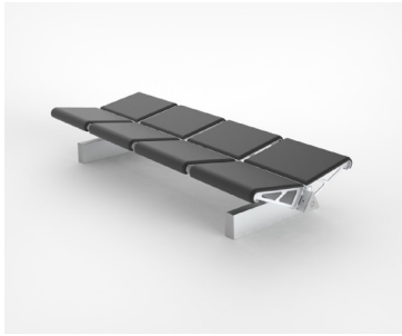
Backless bench moulded polyurethane