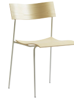
Campus 4 Legs