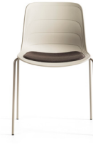
Grade 4 Legs