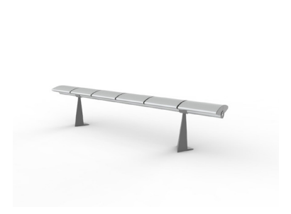
Seville seating system