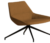
Dunas XL Range