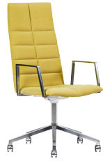
Archal High Back