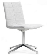
Archal Chair swivel